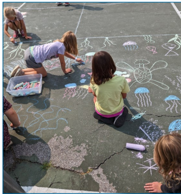
Morning activity time each day at camp involved something new: basketball, line dancing, and sidewalk chalk to name a few!

What a summer God gave us here in Centre Region! Throughout the entire summer 682 children heard the message of the Gospel at 20 5-Day-Clubs, a week of Good News Adventure Camp, and 6 days of the Story House at the Grange Fair! Our team of 6 summer missionaries worked long days at clubs and outreaches teaching Bible lessons, singing songs, and sharing the joy of their salvation with the kids.